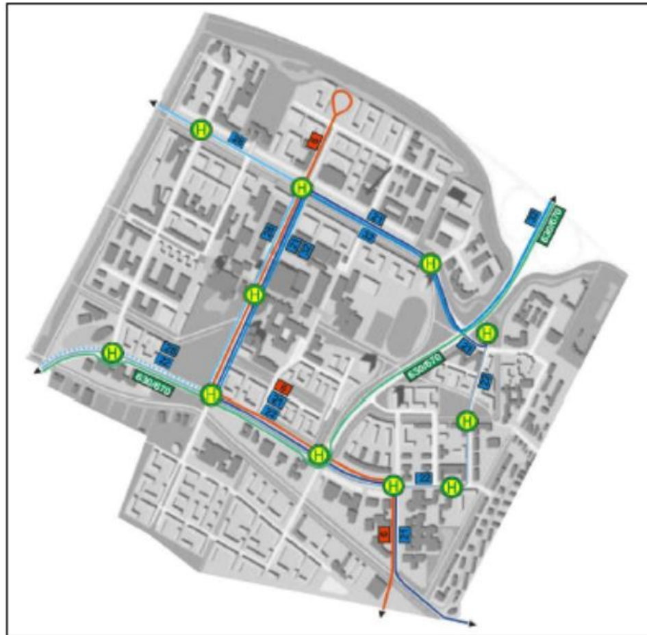
From the project „zeroemissionpark“.

Example of a public transportation network in an industrial area